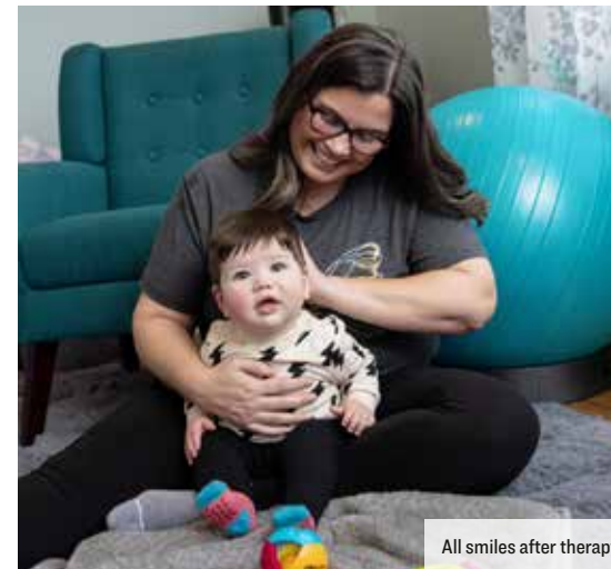
All smiles after therapy